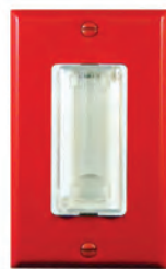
MSR-A or -AV

Strobe subassembly only, no hardware MSR-V-PLUGIN/C Clear lens MSR-V-PLUGIN/O Opaque lens